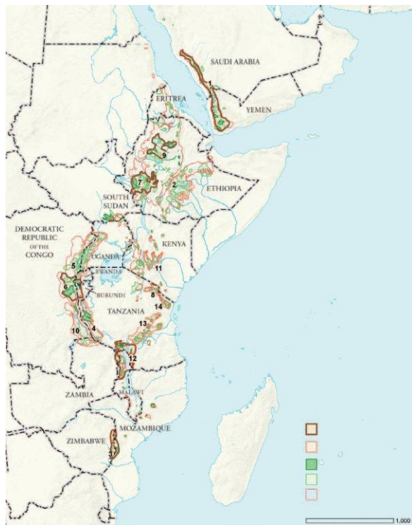
KBAs and corridors.

The Regional Implementation Team (RIT) chosen by CEPF to implement the investment is a consortium of BirdLife International, IUCN and the Ethiopian Wildlife and Natural History Society. With offices in Kenya, Mozambique, Ethiopia and Jordan, and a network of partners throughout the hotspot, the RIT possesses the local knowledge and on-the-ground presence to orchestrate this far-reaching strategy. The RIT will disburse funds through small and large grants programs, supporting a portfolio of projects