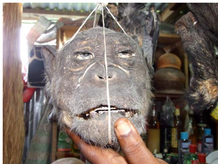
Gorilla poached and sold at the market of mont Bouët in Libreville

Other improvements are necessary (integration of "real time" technologies via mobile telephony, convergence with "online" solutions inspired from Google tools, etc.). However, in view of latest developments in computers and electronics, especially in the manner of use (first, available technical expertise available on the ground), these innovations are still being tested and may be integrated into the daily activities of guards in protected areas only in the future. SMART will therefore be more robust, but only insofar as it remains an "appropriate technology" that matches the needs and capacity of field workers.