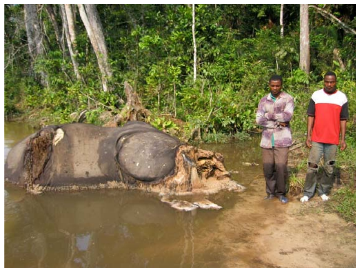
Poaching of elephants in Gabon – the two poachers have been released after payment of a fine – the arm they used belonged to the "Sous-Préfet"

includes the influence of conservation projects financed by international donors that often resort to management by non-State bodies (consulting firms, NGOs, etc.). It should be noted that although this process is not law enforcement, State and non-State actors (national and international NGOs) are increasingly using LEM, through MIST, thus contributing not only to enhancing transparency, but also the accountability of public employees and, ultimately, the direct or indirect participation of civil society in decision-making processes.