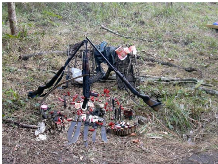
Weapons collected in Gabon (plateaux Batékés) – this kind of automatic arm is in particular used for poaching of elephants

When a decision-maker using MIST ascertains quantitatively and through mapping that there is an issue of non-compliance with the laws in force, it is very difficult for him/her (though unfortunately not impossible) not to do anything to address the situation. Furthermore, the preparation of a MIST report means that many links in the decision-making chain know that the senior decision-maker is aware and is therefore obliged to take a decision. Thus, MIST contributes to strengthening the responsibility of decision-makers.