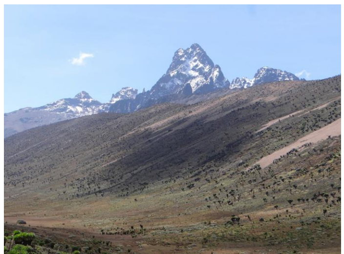
Mount Kenya national park is a World Heritage site and a Biosphere reserve