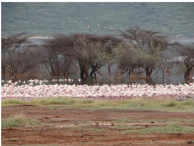
Bogoria Lake (Kenya) is a World Heritage Site and a RAMSAR site

National authorities in charge of MIDAs should ensure that the great variety of expertise of the different communities supporting each designation is jointly shared, in an inter- and transdisciplinary manner, to the benefit of site conservation, management and educational activities.