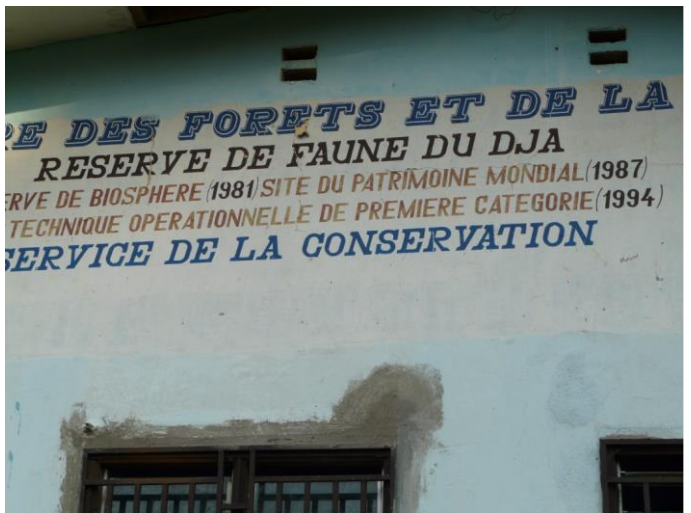
The Dja Reserve (Cameroon) is a World Heritage site and a Biosphere Reserve

Visitor numbers should be adequately managed. and sustainable tourism strategies and plans should be developed and implemented in order to safeguard the conservation and environmental integrity of a MIDA. Tourism activities should be fully compatible with the conservation objectives of all the different designations that apply to the area.