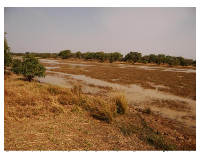
Pendjari National Park in Benin is a Ramsar Site and a Biosphere reserve

The Guidance (please read the manual in extenso for more information) provides an overview of the four international designating bodies to facilitate comparisons between them. It summarizes different aspects of the four designations, such as their purposes, main objectives, history, legal frameworks, administrative arrangements, governance structures and bodies as well as scientific advisory bodies, and governmental obligations. The respective site admission criteria give an idea of the specificities of each designation. Differences among the four designations are also reflected in their reporting requirements and monitoring.