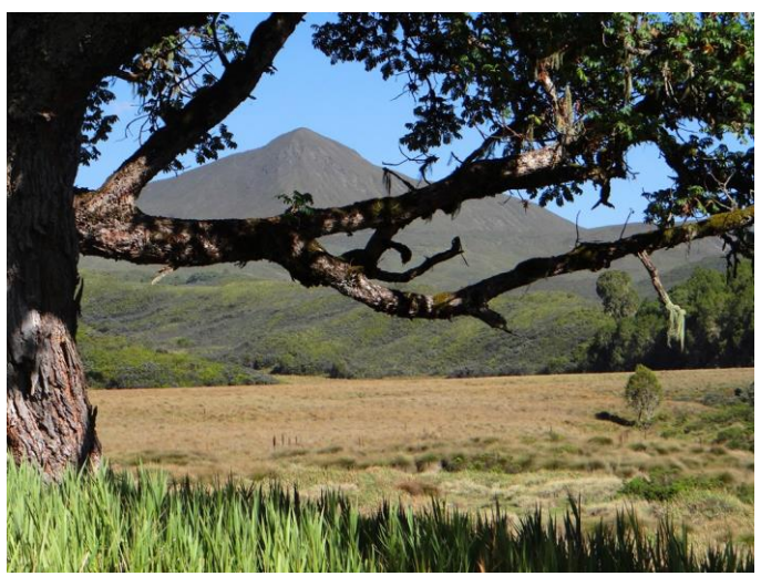
Slopes of Mount Kenya

■ Legal framework: Biosphere reserves are nominated by national governments and remain under the sovereign jurisdiction of the States where they are located. Their status is internationally recognized. They are designated under the intergovernmental MAB Program by the Director-General of UNESCO following the decisions of the MAB International Coordinating Council (MAB-ICC). UNESCO's General Conference approved the Seville Strategy for Biosphere Reserves and