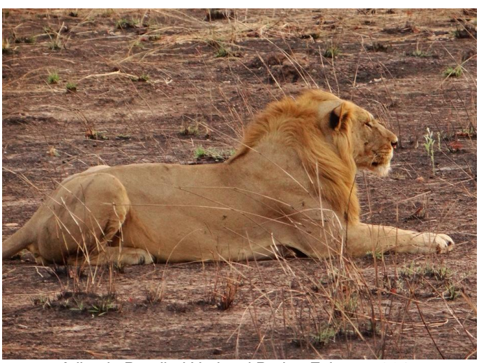
A lion in Pendjari National Park - February 2017

Please also visit the IUCN-GPAP (IUCN global PA program) webpage and read the newsletter: https://www.iucn.org/theme/protected-areas/ourwork/newsletter