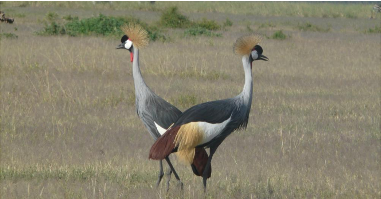
Grey crowned cranes ( Balearica regulorum )