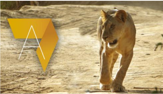
The MOOC-GAP identity card

for anything because they do not have access to training), we needed to promote new channels for the much-needed capacity-building of stakeholders in and around protected areas. This is why IUCN-Papaco has embarked on the preparation of the first MOOC on the management of protected areas in Africa: the MOOC-GAP [Gestion des Aires Protégées (GAP) in French, the original language of the MOOC] 4 .