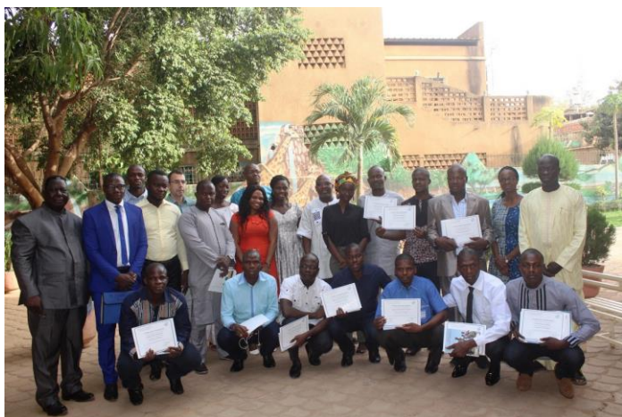
The 14th promotion of the University Diploma at the end of the course, receiving the diploma

Our annual onsite training (UD - University Diploma), organized with the Senghor University (Egypt – Francophonie) and IUCN-PACO , has ended in mid-April, in Ouagadougou: 20 students coming from 10 countries (Benin, Burkina, Côte d'Ivoire, Central African Republic, Guinea, Mali, Mauritania, Niger, Senegal, Togo) have been together for eight weeks and all have all passed the final exam. The course covered several topics such as conservation and protected areas, definitions and categories, governance types, international conventions, planning and management effectiveness assessment, useful biology notions for PA conservation including in marine environment, funding and PA benefits, ecosystem services, climate change, ecological monitoring (including field application) and local development and local population involvement, laws and regulations that applies to PA conservation... The training was funded by the MAVA foundation .