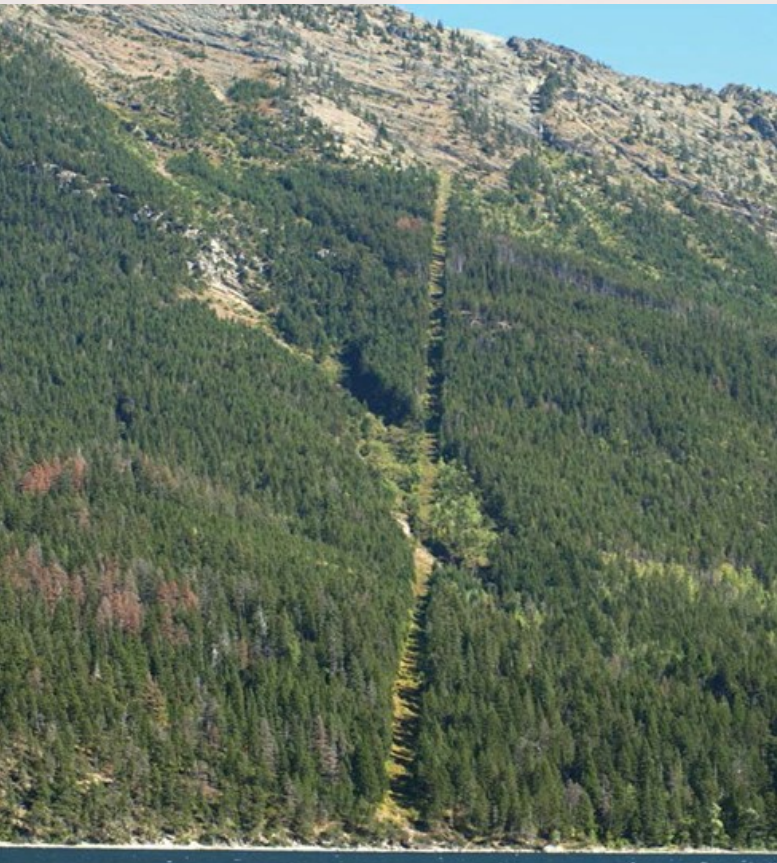
International border between Canada (left) and the USA (right) and the trans-boundary peace parks: Waterton National Park (Canada) and Glacier National Park (USA)