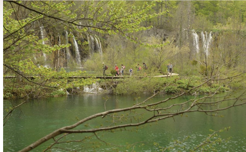
Visitors, boardwalk and the spectacular cascading waterfalls of the Plitvice Lakes National Park World Heritage Property, Croatia

Clearly not all the benefits we derive from natural ecosystems are narrowly utilitarian: humans enjoy a wealth of complicated cultural, psychological and spiritual links with the natural world. Because protected areas tend to be established in particularly