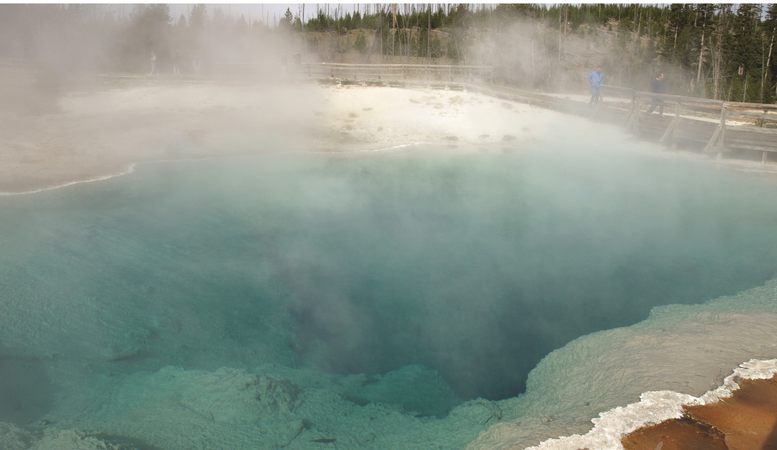
Aesthetic translucent blue of a geothermal boiling water pool, Yellowstone National Park, USA