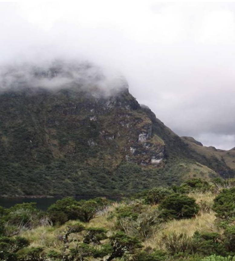
High-altitude paramos water catchment area of Cayamba-Coca Ecological Reserve, Ecuador, which provides ecological services (water) for the capital city of Quito

We summarise information on several techniques for quantifying and valuing benefits in economic and other terms below. But the benefits also need to be understood in the context of competing benefits (so-called trade-offs)—for example, retaining a forest to protect water also means that the timber in the forest is not available for sale or the land for conversion to agriculture or development—and that these benefits and their relative values accrue to different people. One of the persistent challenges in securing ecosystem services is that many services maintained by sustainable management or protection of ecosystems are diffuse in nature, providing many people with a small number of a hard-to-measure benefits (for example, non-monetised and with no clear ownership rights), while unsustainable use provides one or a few people with a lot of benefit (for example, well-monetised with clear ownership rights).